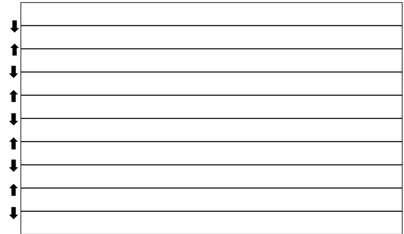
Figure 1 – arrows indicate direction to press seams